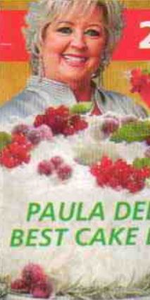
PAULA DEEN'S BEST CAKE EVER!